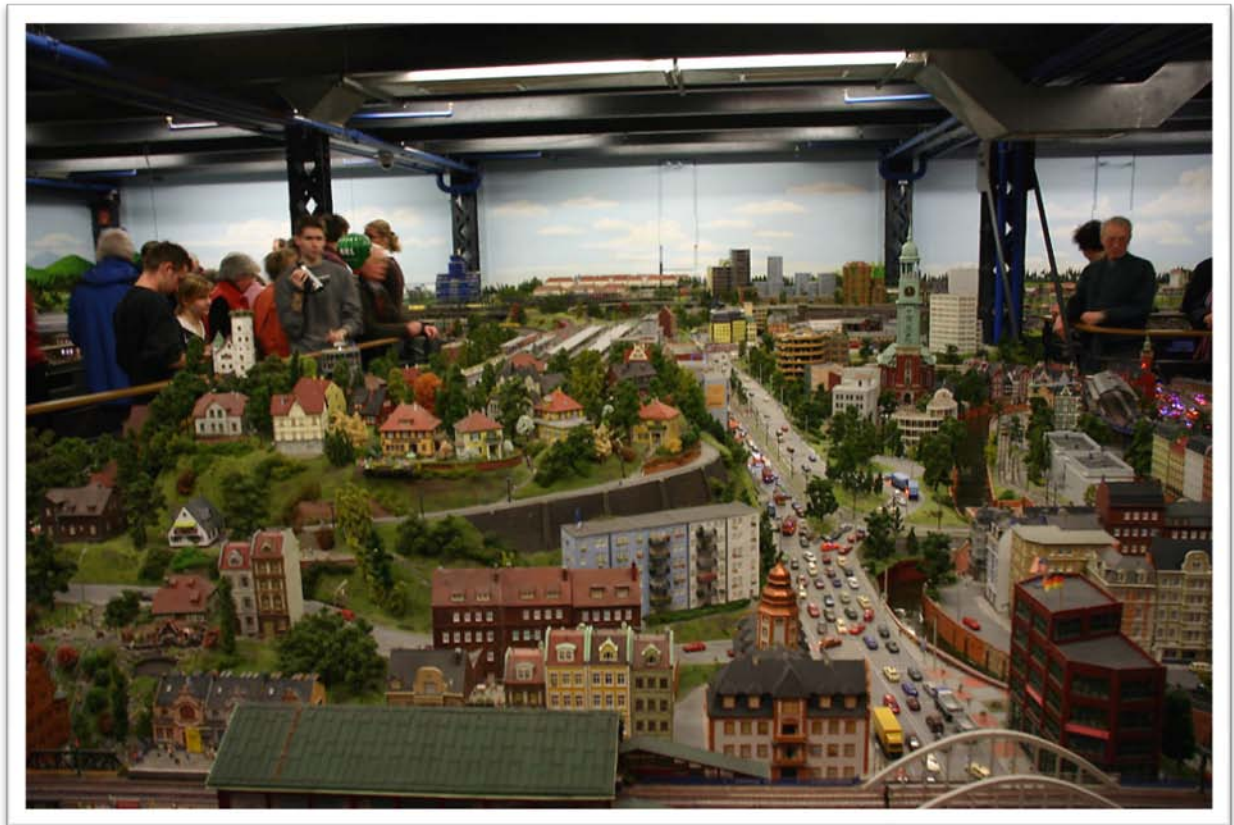
Figure 8 - Miniatur Wunderland Hamburg

Probably the biggest mistake model train beginners make is going too big too quickly... This tends to put too much stress on your budget and the time you have available.