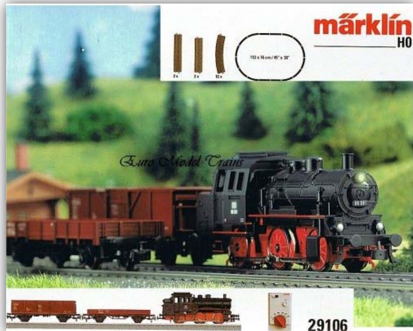
Figure 2 - Marklin Freight Starter Set

Model train starter sets can range from $60 to $300 and upwards. They come with varying components from