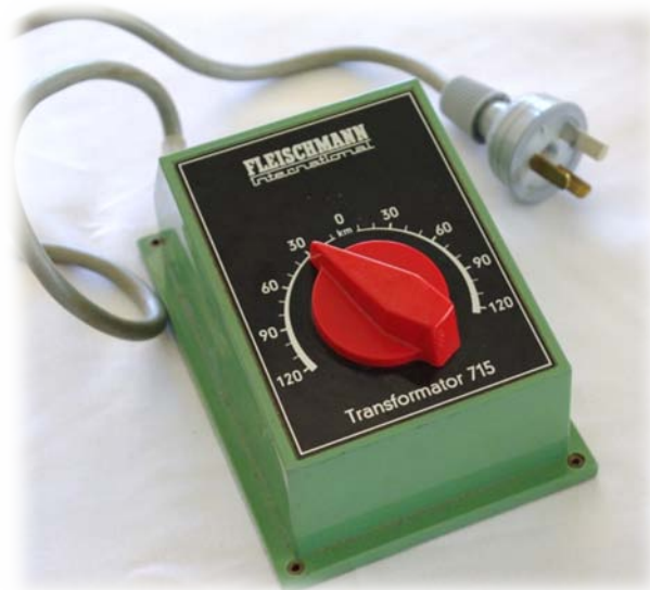
Figure 9 - typical power pack

This voltage is then picked up by the pick-up wheels of your locomotive which powers the locomotive motor.