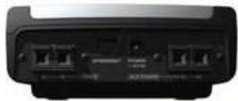
Hornby Select Digital Control R8213