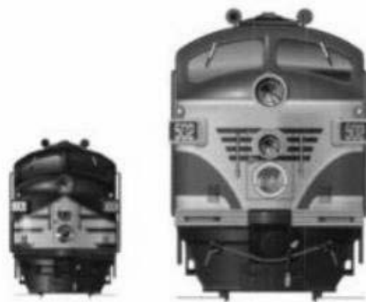
N Scale compared with HO Scale